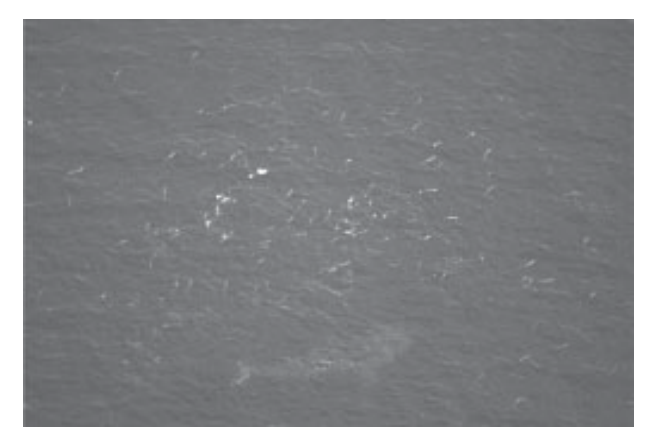
\textbf{Figure 2.} \ \ \textbf{Whale shark stops swimming in the centre of the herring school.}