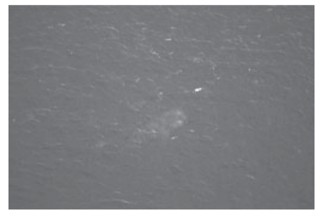
Figure 3. Whale shark adopts a stationary feeding posture.

© Royal Society of Western Australia 2002