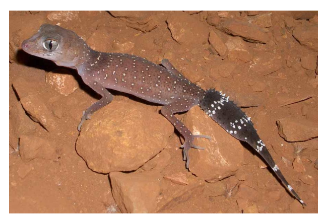
Plate 1. Underwoodisaurus milii at Packsaddle Range, Western Australia. The habitat on which this species was recorded can be seen in the photograph.

A further four specimens of U. milii (Plate 1) were collected from Packsaddle Range on the night of the 7<sup>th</sup> of May 2004 (WAM R157513, R157520, R157522 and R157525). Three were captured on and around a graded track running through a major gully, with piles of broken