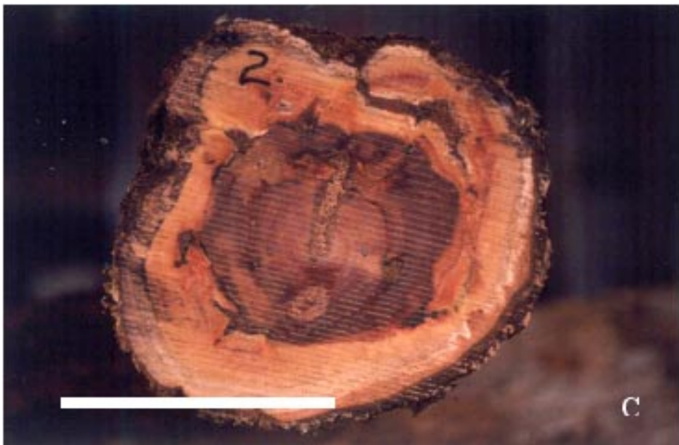
Figure 1 . Canker damage common on stems of E. phylacis . A, superficial split in bark (bar = 5 cm); B, severe canker (bar = 5 cm); C, cross section of stem in Fig. 2b showing decay and discolouration of wood (bar = 5 cm).