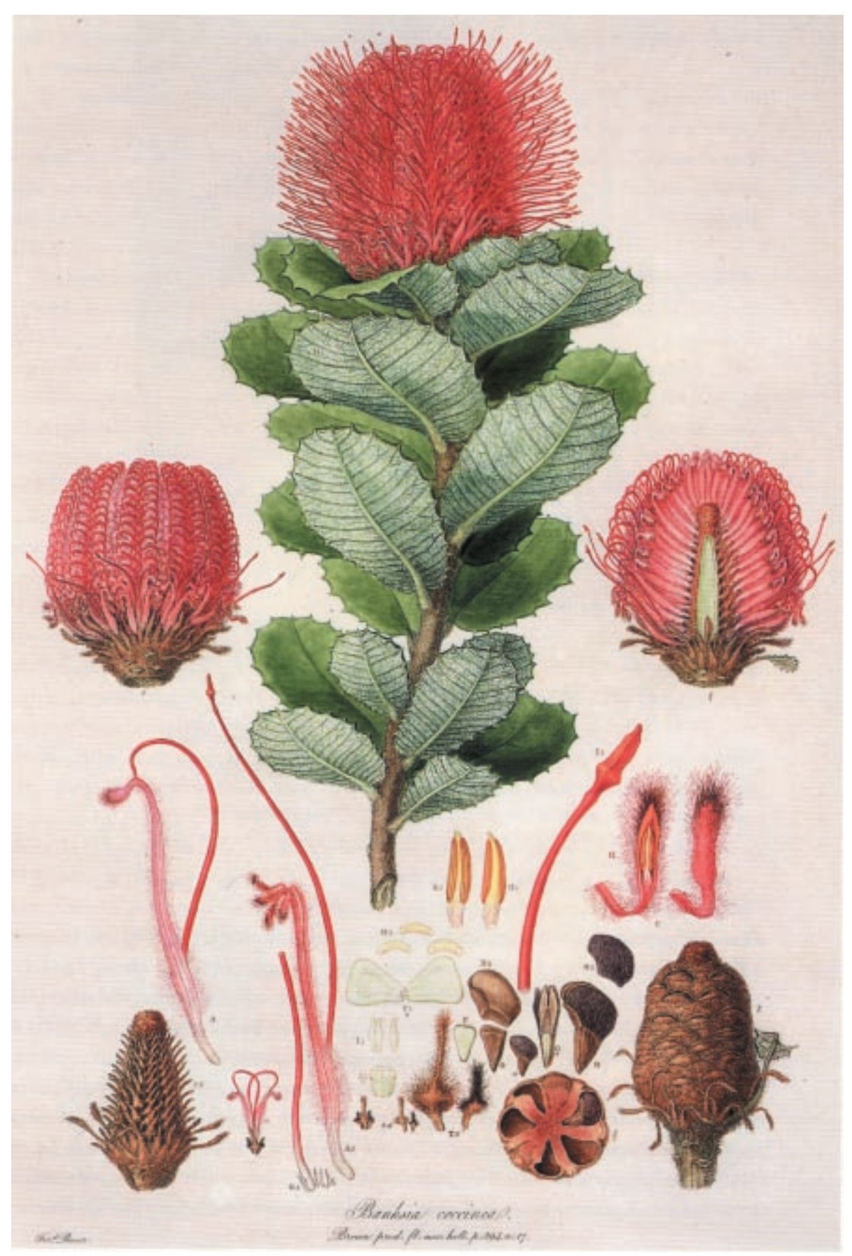
Figure 1. Banksia coccinea drawn by Ferdinand Bauer from a specimen collected at King George Sound, Albany, on the south-western coast of Australia.