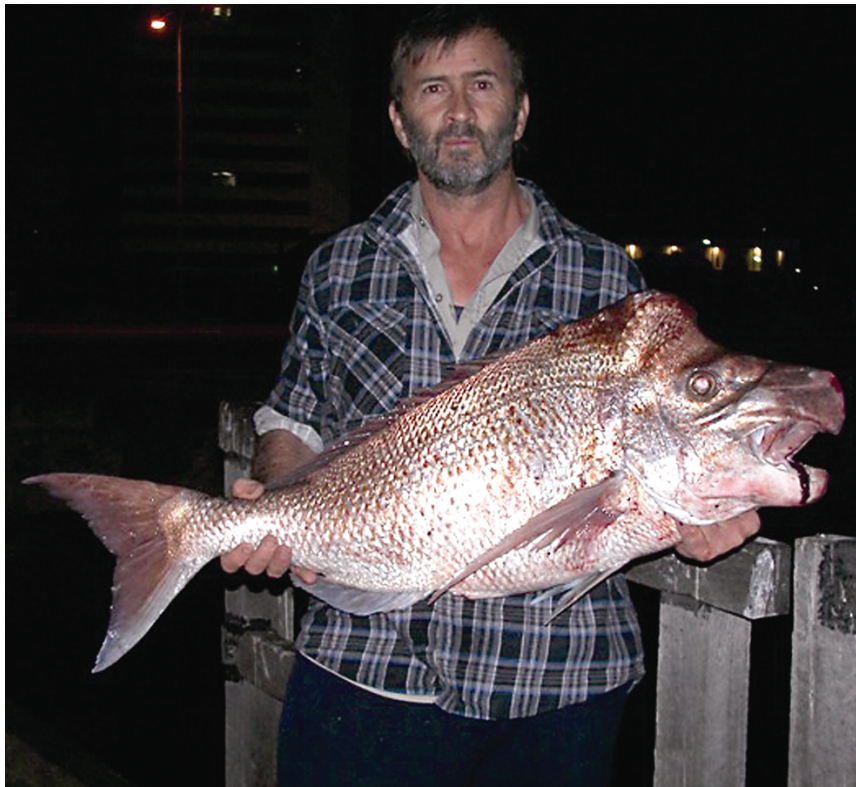
Figure 1. Australia’s oldest recorded snapper (40 years and 10 months) captured approximately 9 nautical miles west of Bunbury, Western Australia.

about 37 years were reported from South Australia and New South Wales (Table 1). Several annuli in the otolith of the oldest snapper from New South Wales were indistinct, leading to some imprecision among repeated counts.