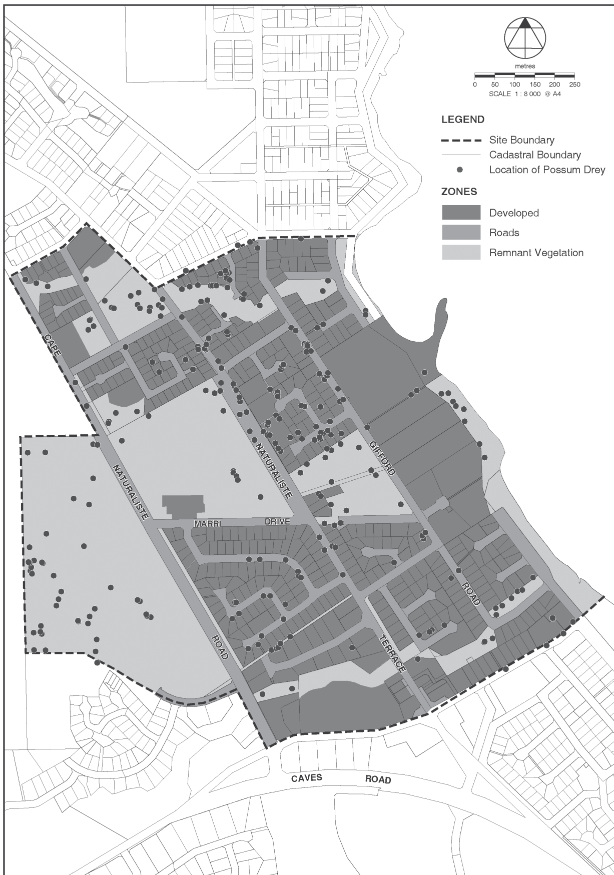
Figure 1. Locations of Pseudocheirus occidentalis dreys in the Dunsborough town site.