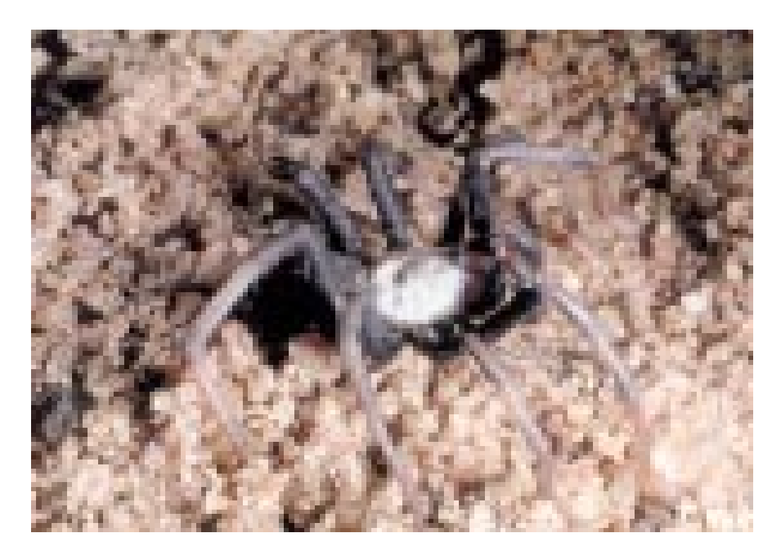
Figure 1. Arbanitis mcmillani sp nov, male (holotype) in life. (Photo R P McMillan).

glabrous, with an enamel-like sheen, and with black, rod-like spines. Labium with a few elongate cuspules. Palpal tibia with pronounced process with many stout spines (at least 30); embolus with prong-like tip; tibia I without apophysis but with a proventral comb of three spines. Tarsi I - III without spines.