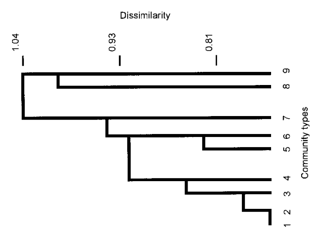
Figure 2. Dendrogram of the nine community types occurring on ironstone on Swan and Scott Coastal Plains.

Community type 1 occurs on the massive ironstones to the south of Busselton on skeletal soils. This soil layer is generally less than 1 cm deep and is often