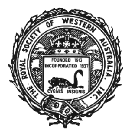
Figure 5. Crest of the Royal Society of Western Australia after incorporation.

the date of incorporation, which appears in Volume 33 (1936-1937) of The Journal (Fig 5).