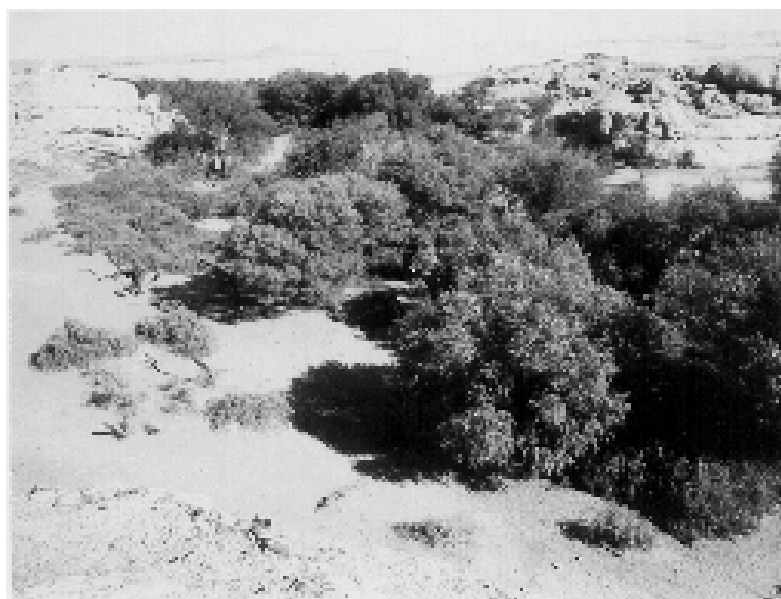
Figure 1. The interface of sand, river, and rock in the Namibian Desert near Gobabeb. The light-colored material in the foreground is sand at the edge of the riverine vegetation of the Kuiseb River. On the other side of the river are granitic outcrops. Barely visible in the background beyond the rocks is the gravel plain of the Namib. Both the rocky areas and the river support vegetation that is quite different from either of the two major habitats (the dune fields and the plains). The mammals of the rocks are also distinct from those of the other major habitats.

Here, I extend the comparisons of the Namib Desert, Brazilian Caatinga, and Argentine Andes to consider the effect of granite outcrops on the structure of the entire mammalian community in these three areas. I first provide a brief comparative review of the regions and their history to permit a greater understanding of how mammals have adapted to rock-piles, a significant abiotic structural component of their habitat in three markedly different drylands on two southern continents.