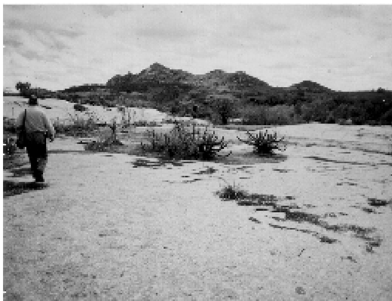
Figure 2. A broad granite surface exposure (lajeiro) in the Caatinga of northeastern Brazil. In the background are rocky outcrops (serras). Lajeiros collect water and form micro-communities of plants (evidenced by the cacti, shrubs and grasses in the center of the photo). Serras support shrub and tree communities that are distinct in physiognomy and persistence of green vegetation from the surrounding Caatinga scrub forest. The mammals of the lajeiros, serras, serrotes (larger outcrops that form small hills), and chapadas (outcrops that are larger still, forming small mountains) are very distinct from those of the non-rocky areas.