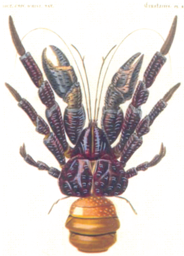
Figure 3. Coconut or robber crab, from Dictionnaire D'Histoire Naturelle , 1849.

appreciating that they were similar to the forms occurring in Australia. The massive rounded boulders formed through the decomposition of granite, and the spheroidal weathering of the resulting corestones.