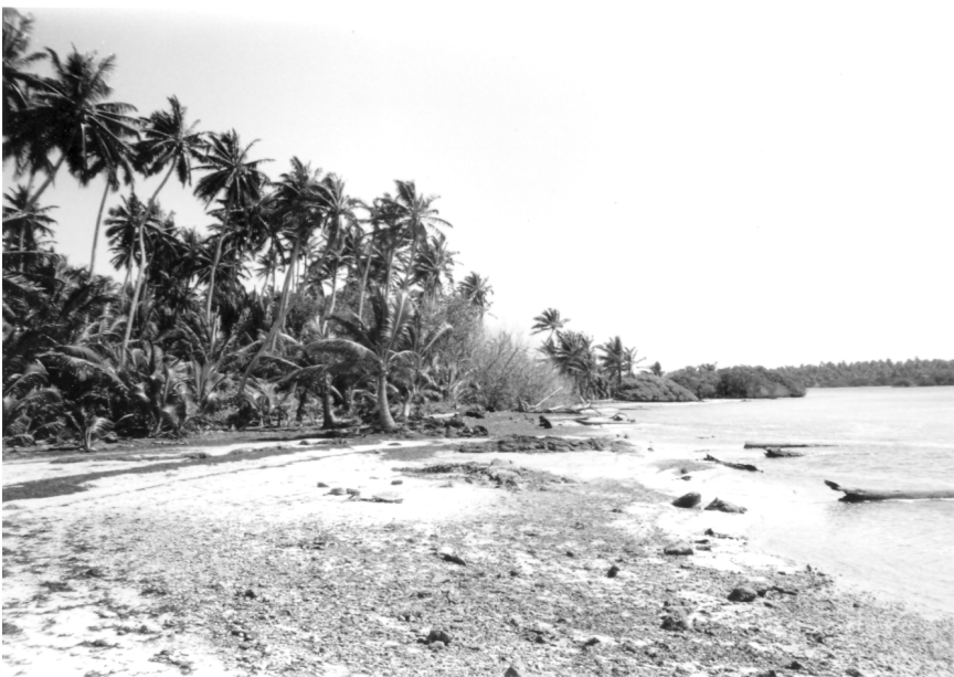
Figure 4. Inner lagoon, Cocos (Keeling) Islands.

There is a certain triumphalism in this: Darwin seems to be appreciating his own 'eye of reason'. It was at Cocos that the Coral Atoll Theory 'came together'. He was able to apply what had hitherto been largely a theoretical construct to a real world example of an atoll or 'lagoon island' (Figure 4). He wrote extremely detailed notes, both on the geomorphology of the coral reefs and the